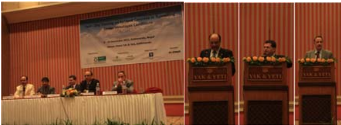
Welcome speech in Inauguration session