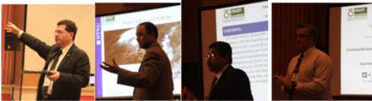
Speakers giving lectures