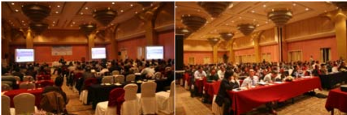
View of the training participants