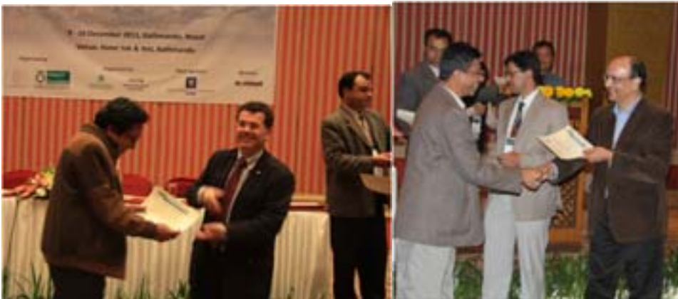
Distribution of certificates to participants