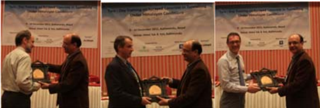
Distribution of Token of appreciation to speakers

NTA distributed token of appreciation, carved wooden pigeon window, to all speakers and sponsors. Similarly certificates were distributed to all participants.